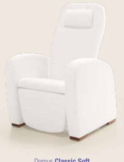
Domus Classic Soft

Lever manipulations belong to the past with the Domus Classic chair. The Classic mechanism can be easily adjusted by simply pushing yourself off. This chair first raises the legs, after which it is possible to further incline the whole chair. Obtaining a new seating position requires almost no effort.