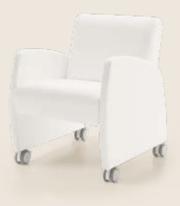
Domus Club-1 Flex with castors