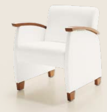
Domus Club-1 Flex with wooden ergonomic armrests and legs 09710 *