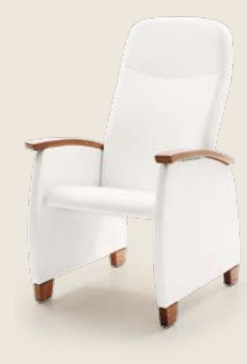
Domus Easy Chair Flex with wooden ergonomic armrests and legs 09887 *