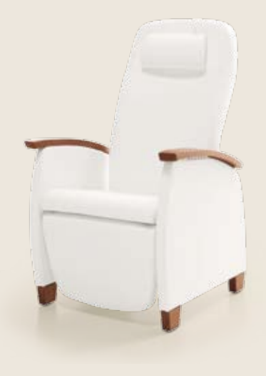
Domus Classic Flex with wooden ergonomic armrests and legs 08901 *