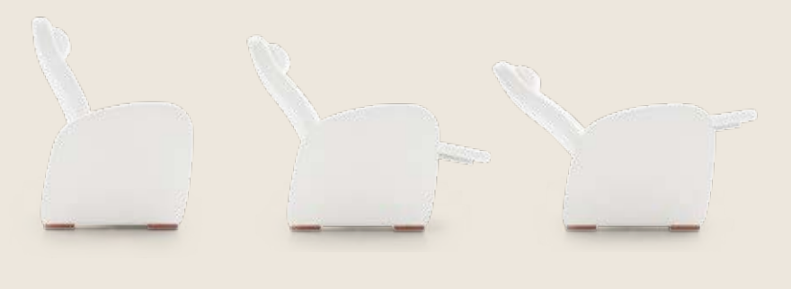
Domus Classic in seating position